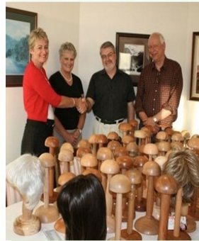
Wig stand presentation

One strong focus of the guild has always been to share what we can do with our community and we are currently involved with several projects that reflect this.